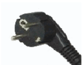
DIN49441 16A plug