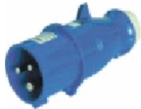
IEC60309 plug (32A 2P+E)