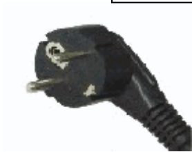
DIN49441 16A plug